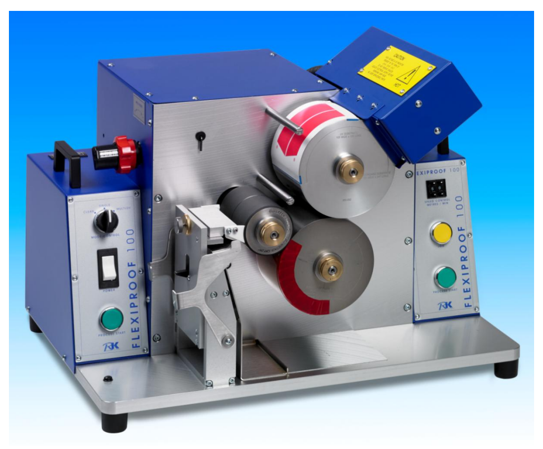
The FlexiProof 100 UV

The RK FlexiProof 100 offers a high speed, operator-friendly machine for the production of proofs using water, solvent or UV Flexographic inks. It is an essential tool for all those involved in the manufacture and use of flexo inks. Ideal for quality control testing to ensure consistency of performance of inks and substrates over time, presentation samples, printability of substrates, R&D including product and commercial viability, and computer colour matching data.