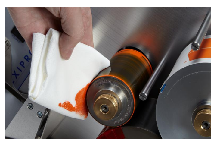
6 Clean the anilox roll while it rotates. The printing plate is also easily cleaned with the machine stopped. Use the mirror to check that it's clean.