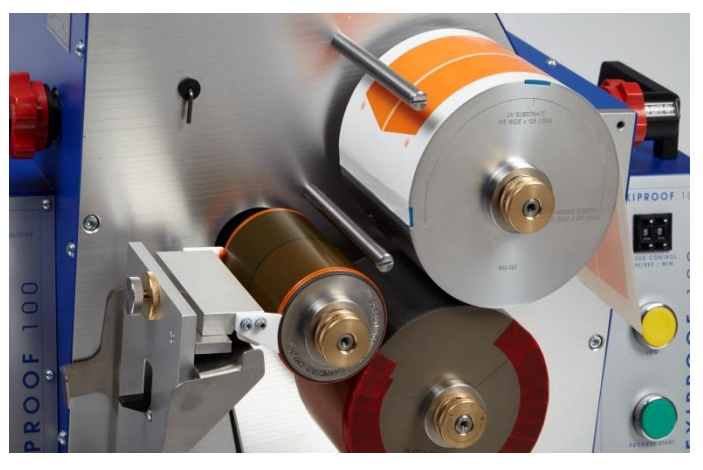
First the anilox roller accelerates to print speed and rotates 3 times to distribute the ink. Then the plate and impression rollers rotate through one revolution to produce a proof.