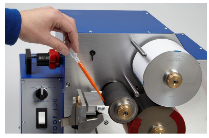
3 Apply ink using a disposable pipette. Side dams fitted at each end of the doctor blade provide a reservoir holding sufficient ink for producing multiple proofs when required.