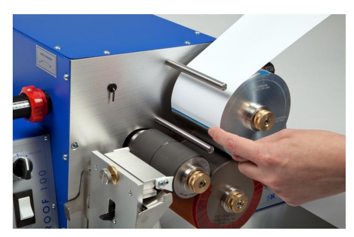
Fit substrate (105mm x 297mm) to impression roll using the self-adhesive substrate strip. Set printing speed up to 99m/min.