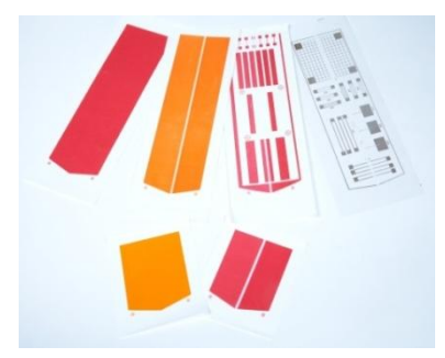
Print samples of the FlexiProof 100

The FlexiProof 100 eliminates the need to use a production line printing press for pilot runs, as the machine is a scaled down but exact version of a full sized flexo press.