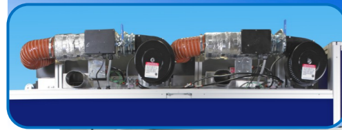
Integrated heating and extract system