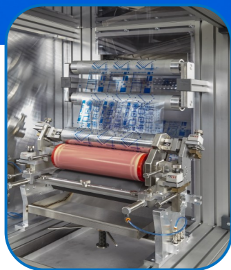
Coating Station in optional ATEX Zone